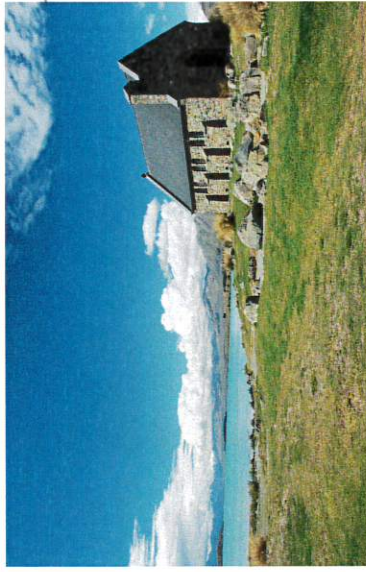
Church of the Good Shepherd – Lake Tekapo